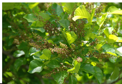
Pongamia flowers and buds

Growing our own fuel sources certainly seems to be the way forward!